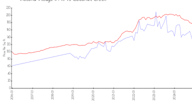
Victoria Village (A-K) vs Coconut Creek