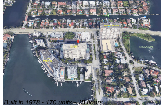
Built in 1978 - 170 units, 18 floors

The above valuated price is a baseline figure that does not take into account any specific renovation, upgrade, split, merge, or deterioration of the unit.