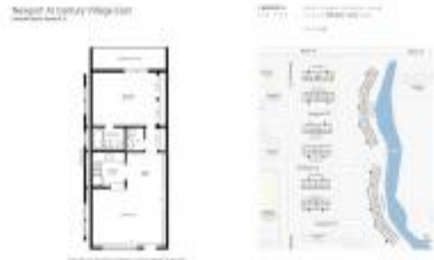
Built in 1974/1978 - 796 units - 2 floors

1 Newport A - 1-4120 Newport, Deerfield Beach, FL, Broward 33442