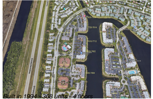
Built in 1994 - 368 units - 4 floors