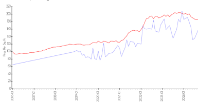
Lucaya Village (A to D - 1 & 2) vs Coconut Creek