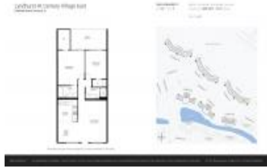
Built in 1974/1977 - 480 units - 4 floors

The above valuated price is a baseline figure that does not take into account any specific renovation, upgrade, split, merge, or deterioration of the unit.