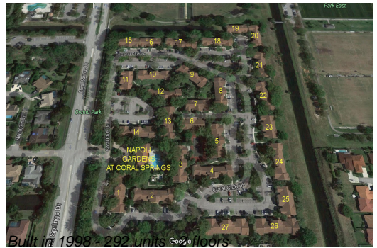
Built in 1998 - 292 units Google floors