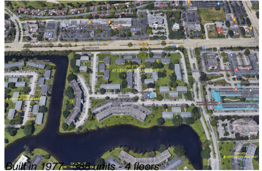
Built in 1977, 388 units - 4 floors