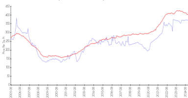
Residences on Hollywood West vs Hollywood Beach