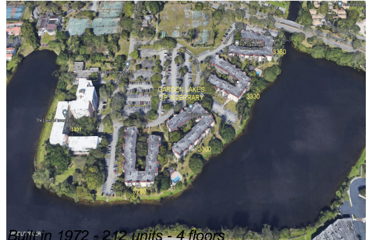
Built in 1972 - 212 units - 4 floors