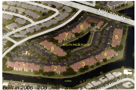
Built in 2006 - 208 units - 3 floors