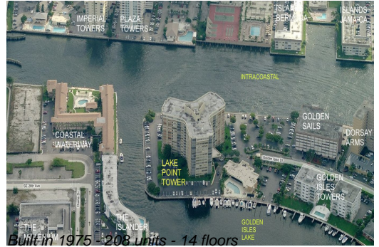
Built in 1975 - 208 units - 14 floors