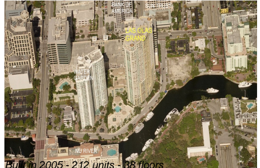
Built in 2005 - 212 units - 38 floors