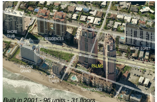
Built in 2001 - 96 units - 31 floors