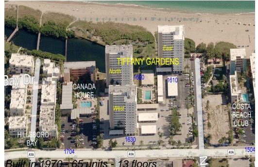
Built in 1970 - 65 units - 13 floors