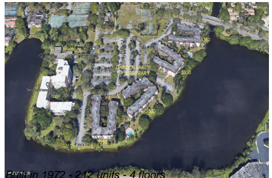
Built in 1972 - 212 units - 4 floors