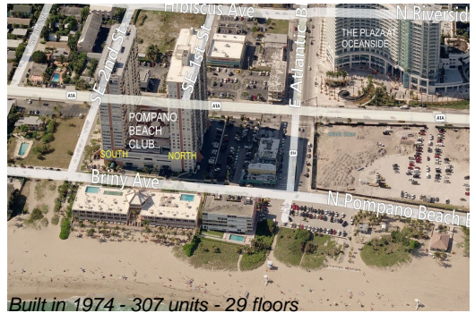
Built in 1974 - 307 units - 29 floors