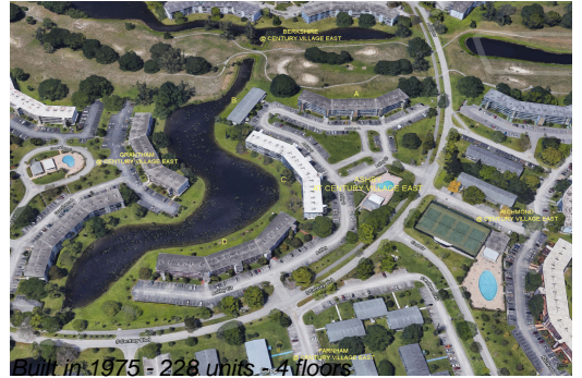
Built in 1975 - 228 units - 4 floors