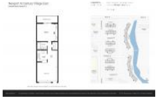
Built in 1974/1978 - 796 units - 2 floors

The above valuated price is a baseline figure that does not take into account any specific renovation, upgrade, split, merge, or deterioration of the unit.