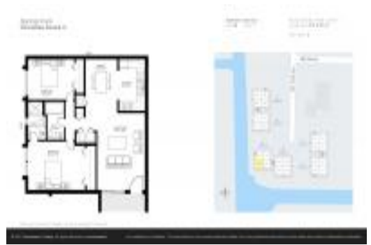
Built in 1982 - 48 units - 2 floors

The above valuated price is a baseline figure that does not take into account any specific renovation, upgrade, split, merge, or deterioration of the unit.