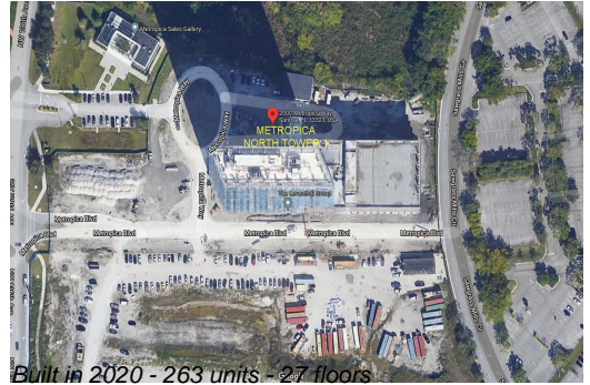
Built in 2020 - 263 units - 27 floors