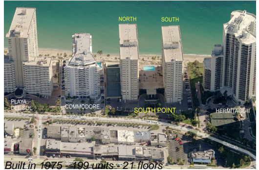
Built in 1975 - 199 units - 21 floors