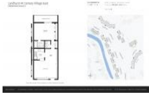
Built in 1974/1977 - 480 units - 4 floors

The above valuated price is a baseline figure that does not take into account any specific renovation, upgrade, split, merge, or deterioration of the unit.