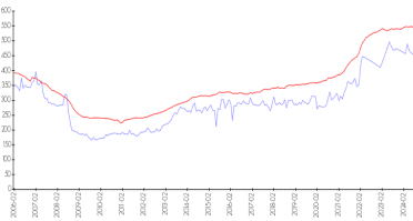
Nu River Landing vs Fort Lauderdale