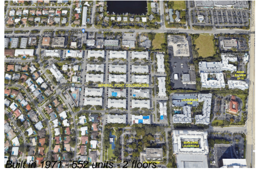
Built in 1971 - 552 units - 2 floors