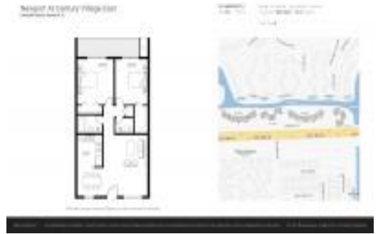
Built in 1974/1978 - 796 units - 2 floors

The above valuated price is a baseline figure that does not take into account any specific renovation, upgrade, split, merge, or deterioration of the unit.