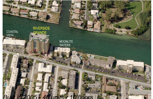
Building 2005 - 40 units - 10 floors