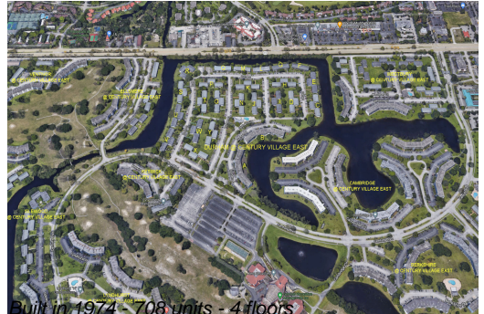
Built in 1974 - 708 units - 4 floors