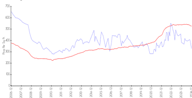
Q Club vs Fort Lauderdale