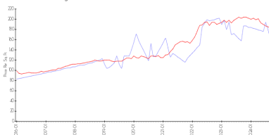
Andros Village (A B C D & E) vs Coconut Creek