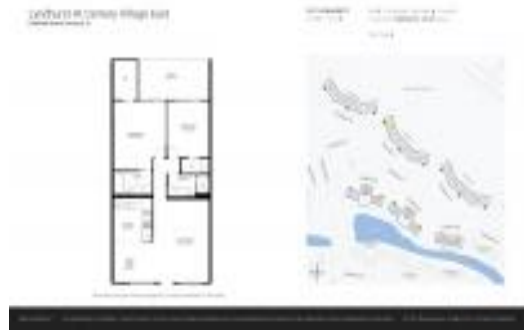
Built in 1974/1977 - 480 units - 4 floors

The above valuated price is a baseline figure that does not take into account any specific renovation, upgrade, split, merge, or deterioration of the unit.