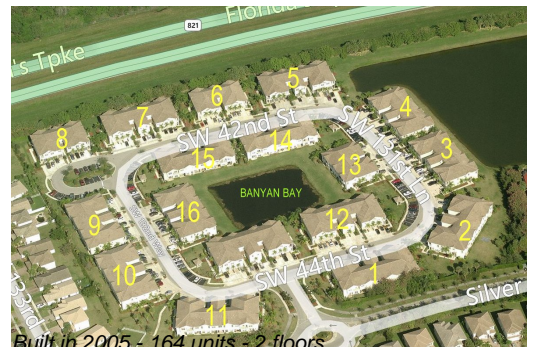
Built in 2005 - 164 units - 2 floors