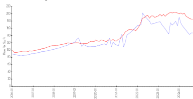
Abaco Village (A B C F G & H) vs Coconut Creek