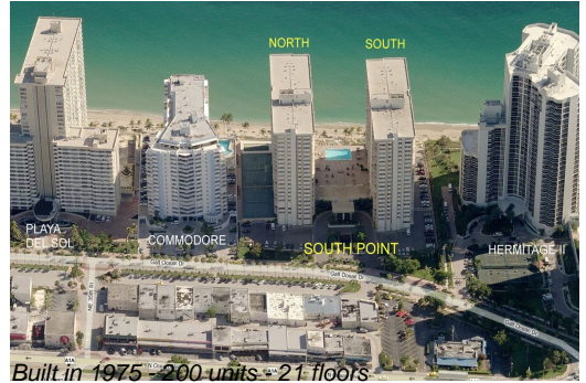
Built in 1975 - 200 units - 21 floors