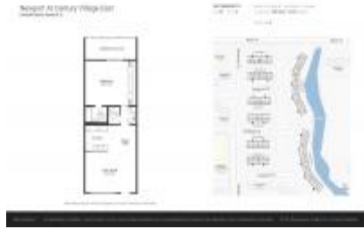
Built in 1974/1978 - 796 units - 2 floors

The above valuated price is a baseline figure that does not take into account any specific renovation, upgrade, split, merge, or deterioration of the unit.