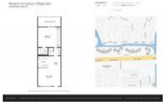
Built in 1974/1978 - 796 units - 2 floors

The above valuated price is a baseline figure that does not take into account any specific renovation, upgrade, split, merge, or deterioration of the unit.