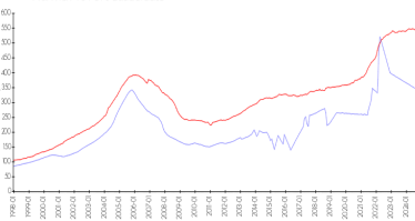
Warwick vs Fort Lauderdale