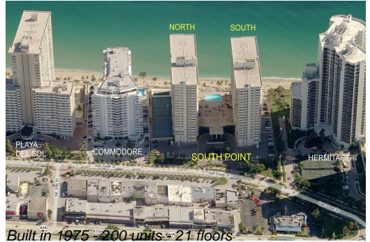
Built in 1975 - 200 units - 21 floors