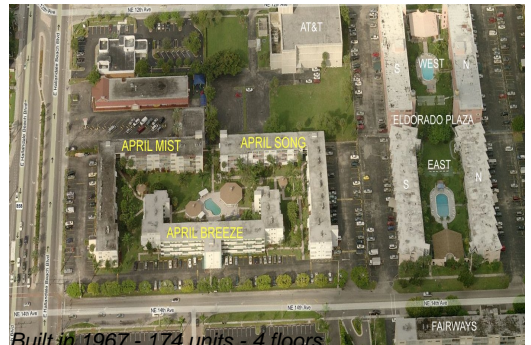
Built in 1967 - 174 units - 4 floors