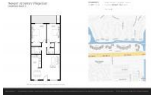
Built in 1974/1978 - 796 units - 2 floors

The above valuated price is a baseline figure that does not take into account any specific renovation, upgrade, split, merge, or deterioration of the unit.