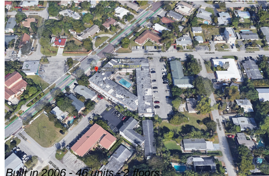
Built in 2006 - 46 units - 2 floors