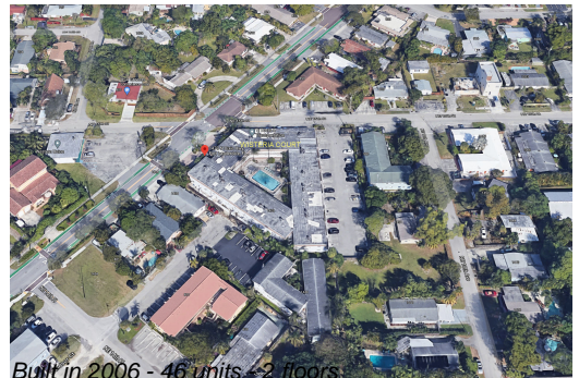
Built in 2006 - 46 units - 2 floors