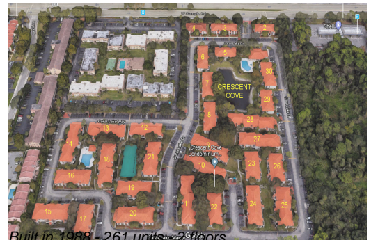
Built in 1988 - 261 units - 2 floors