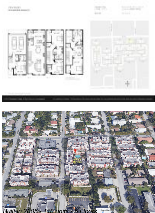
Built in 2005 - 118 units - 6 Floors

Villa Medici: 132 days Fort Lauderdale: 89 days