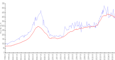
Sea Air Towers vs Hollywood Beach