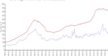
Coral Ridge Towers (West) vs Fort Lauderdale