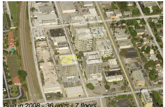
Built in 2008 - 36 units - 7 floors