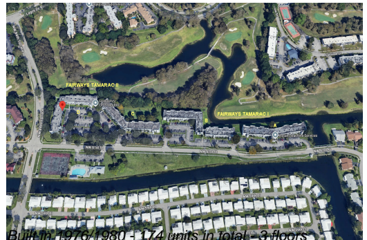
Built in 1976/1980 - 174 units in total - 3 floors