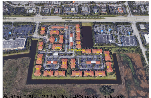
Built in 1999 - 21 blocks ~468 units - 3 floors