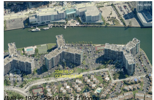
Built in 1982 - 296 units - 11 floors